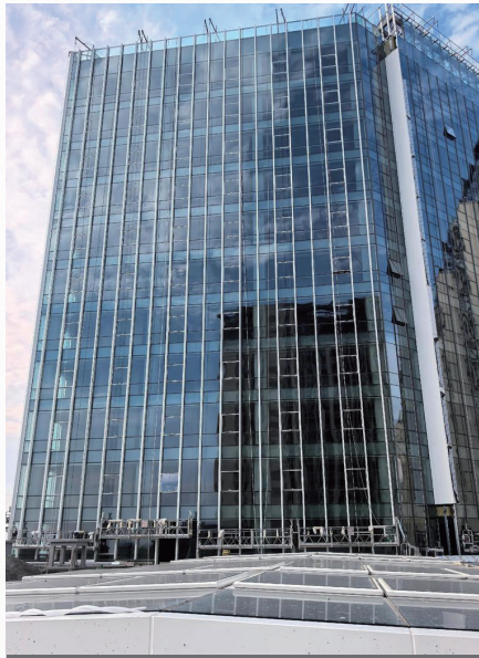
Large Flat Glass Curtain Wall