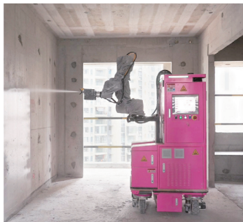
Foshan Shunde Boyue Bay