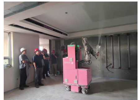
Shantou Jinping Xincheng Bay

Official Website: https://en.bm-robot.com/