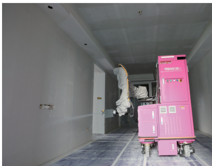
28 Light Years (Fengtong Garden)

Compared to traditional manual coating works, robotic construction simplifies the workflow while improving construction efficiency, reducing safety risks, enhancing on-site working conditions, and ensuring consistent finishing quality. When coordinated with other indoor coating and finishing robots, it helps shorten the overall construction cycle and reduce comprehensive project costs.